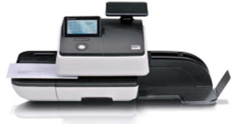
Postbase Series: _____

Enter your design in the artwork box. When designing your advert, keep in mind the maximum available printing area is approximately 44mm wide by 24mm height.